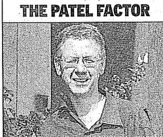
THE PATEL FACTOR